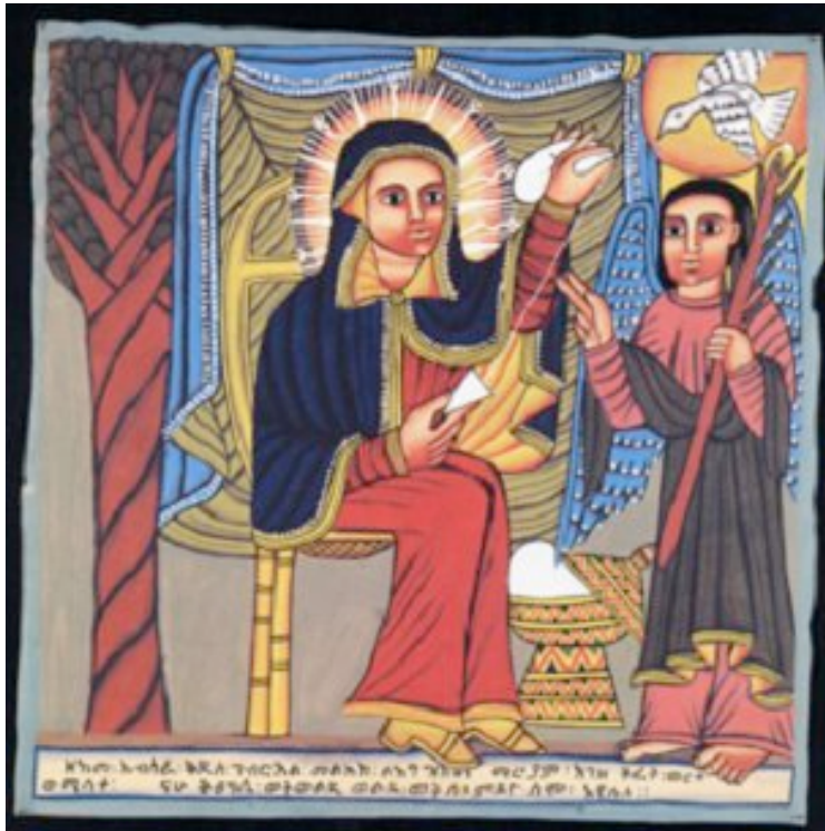
ICON OF THE ANNUNCIATION