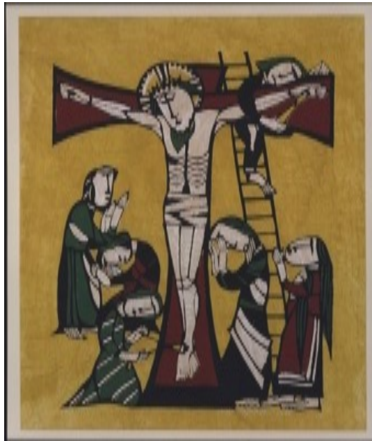
Woodcut by Sadao Watanabe, Japanese, 1965